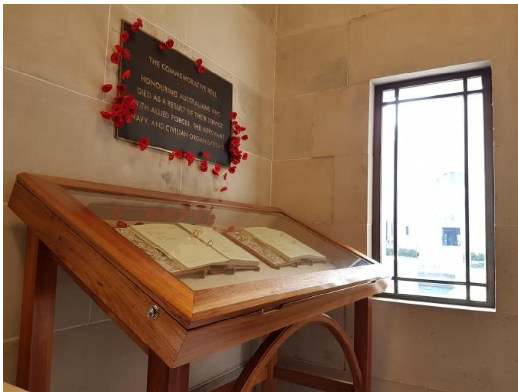
Commemorative Roll Book at The Australian War Memorial