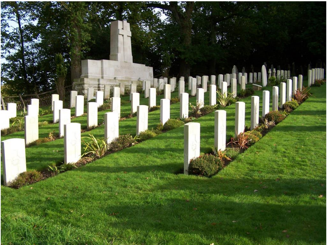
New Zealand War Graves in St. Nicholas' Church, Brockenhurst