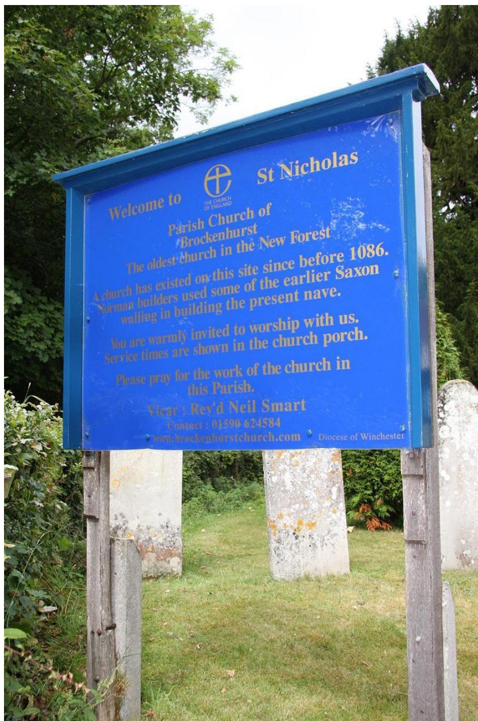
St. Nicholas' Church, Brockenhurst