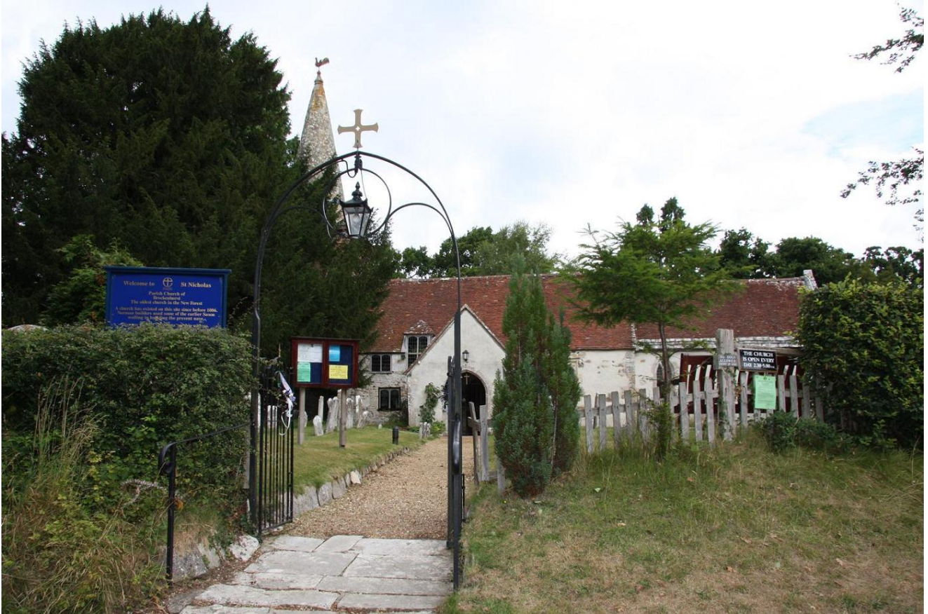
St. Nicholas' Church, Brockenhurst