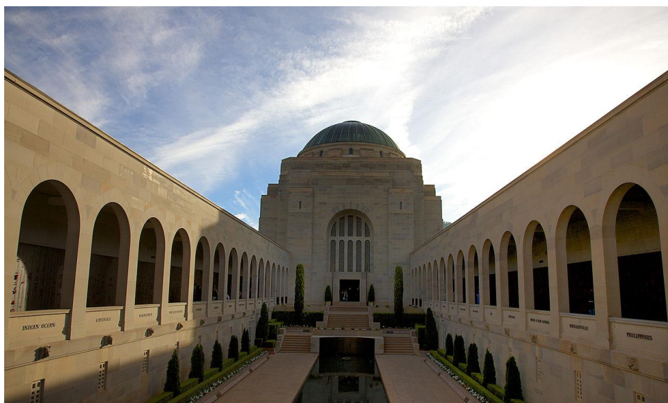
Commemorative Area of the Australian War Memorial