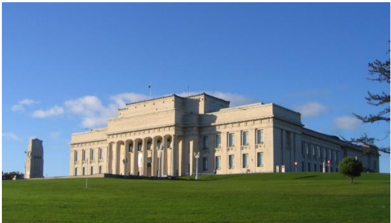
Auckland War Memorial Museum