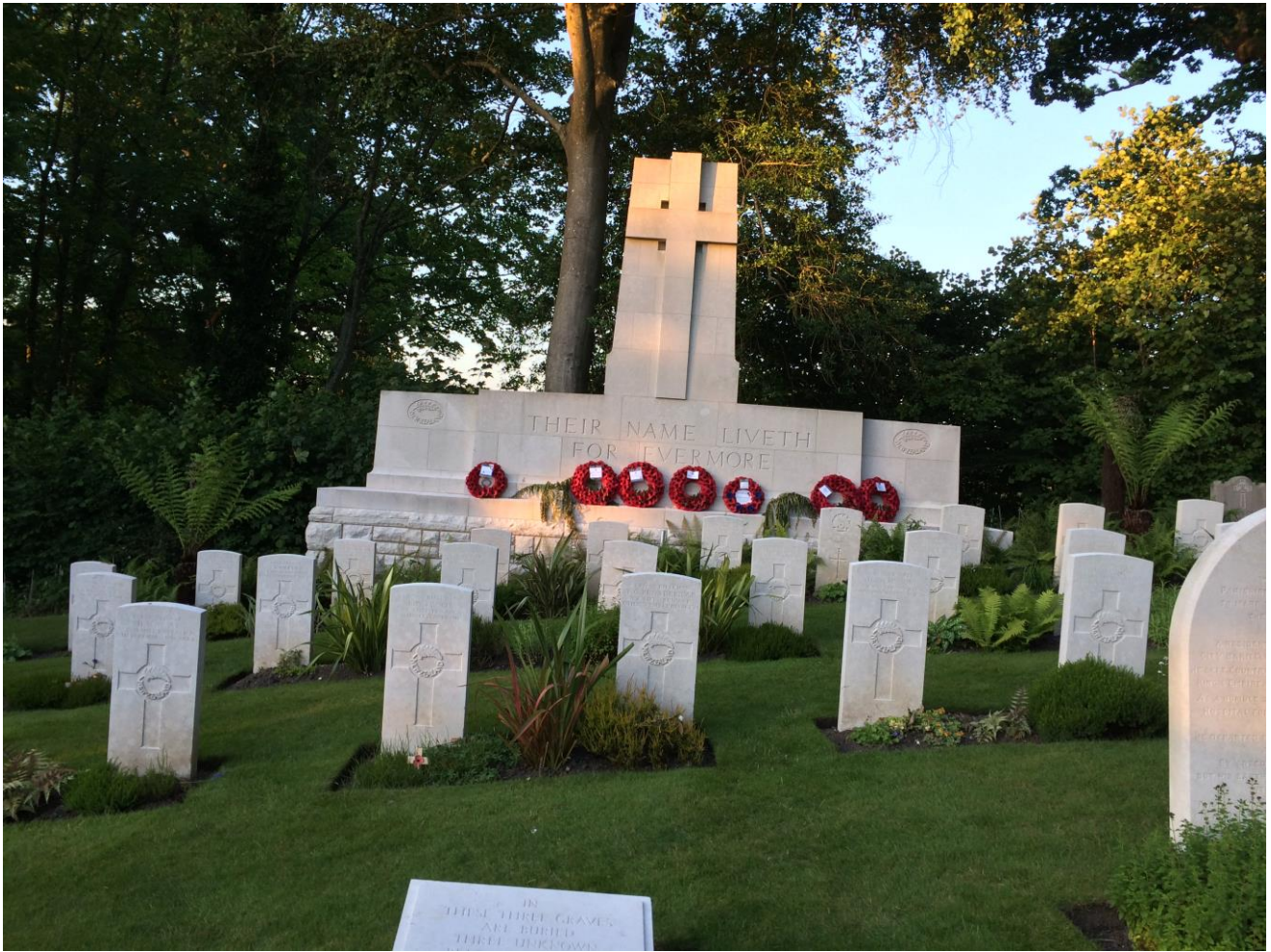
The Cenotaph with New Zealand War Graves & 1 Australian War Grave